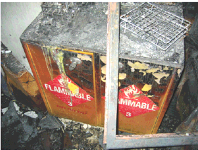
Fire burnt the exterior of the storage cabinet

The following guidance applies to ventilation and use of all cabinets used for storage of flammable and combustible liquids, including cabinets under fume hoods, in rooms where greater than 10 gallons of flammable and combustible liquids are stored. In rooms where 10 gallons or less are stored, flammable cabinets are recommended but not required. For additional guidance regarding flammable liquids storage, please refer to the EHS policy SY08 Storage, Dispensing, and Use of Flammable Liquids ( http://guru.psu.edu/policies/SY08.html ). For questions not covered in these documents or for assistance with more complicated issues, please contact EHS at 814-865-6391.