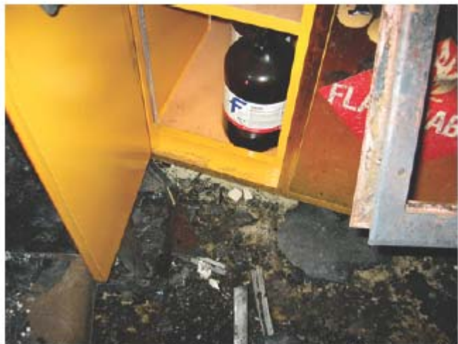
Flammable solvents inside were protected from the fire

Q: Why store flammable and combustible liquids inside a flammable liquid storage cabinet?